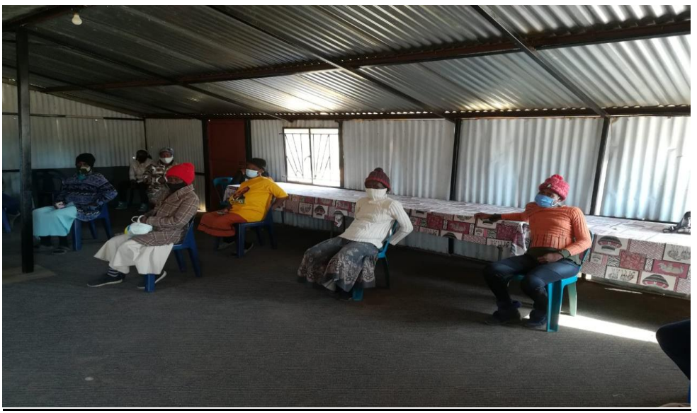
STEERING COMMITTEE COMPRISED OF PARENTS OF OUR AYGW AND YOUNG BOYS AND MEN: ROODEPOORT CENTRE