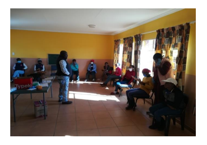
(Dark City Centre AGYW Club in session with the team)

We had teenage mothers, teenage pregnant women, young girls and boys. The Club is getting larger by day and we hope to reach a bigger number in July.